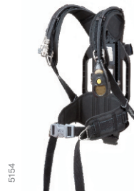
Dräger PSS 5000

Utilizing the established Dräger PSS Pneumatics and cylinder strap design, the Dräger PSS 5000 combines established technology, state-of-the-art materials and innovative thinking to create a SCBA for virtually any application.